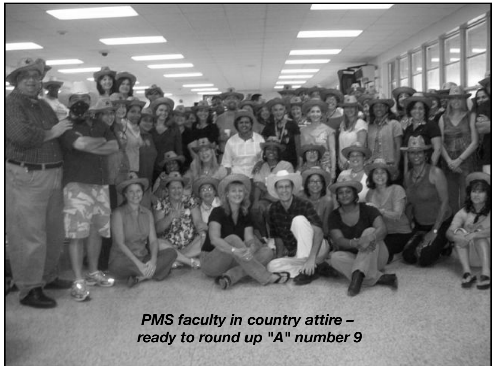
PMS faculty in country attire – ready to round up "A" number 9

Thanks to all noted, this event was super well orchestrated, down home, yet classy. The faculty and staff are truly in the mode to rope in A #9. We really do appreciate all of the work that they do for our kids!